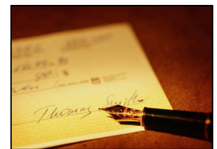
Absolute Value for Money

After several years of working within Scotland's Central Belt we have established good working relationships with professionals in various disciplines who are all at the top of their game. This network is available at your fingertips.