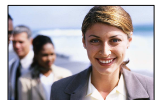
Walk away with a smile.

Please contact us and tell us a little more about your project and we will direct you to the appropriate client who will give you a positive reflection of our services and how we delivered their project taking all of their worries away..