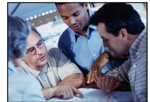
Professionally dedicated team

At block architects® we understand that construction projects can be testing for everyone involved. Our tried and tested service recognises that good communications between the whole design team and the client ensures the realisation of the vision. We operate on a full communication policy and will call, email or write a letter in order to keep everyone informed. Contact us now if your professionals are not keeping you informed.